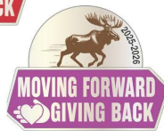
Moose Legion & WOTM pin