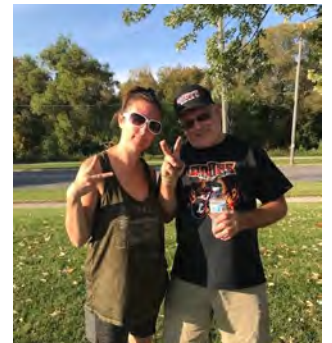
2nd Place Luck of the Draw