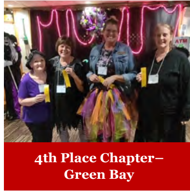
4th Place Chapter– Green Bay