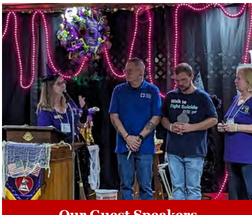
Our Guest Speakers from NAMI & AFSP