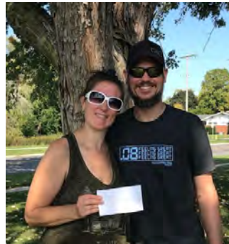
2nd Place Tournament