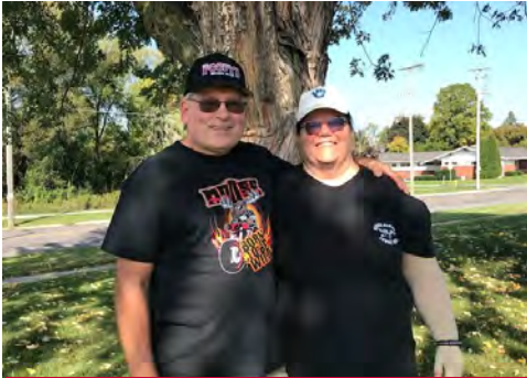
1st Place Tournament