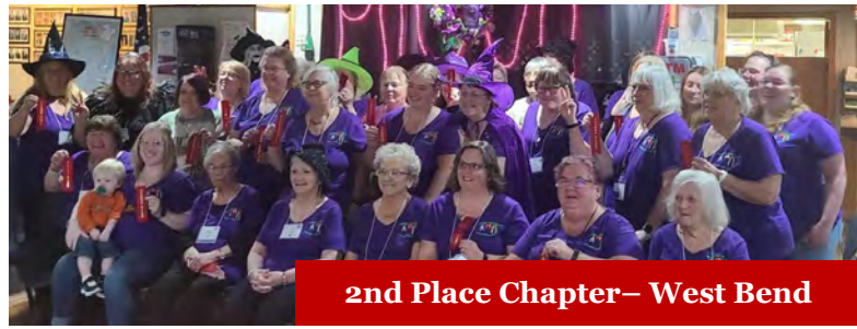
2nd Place Chapter– West Bend