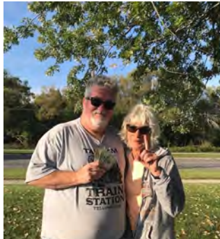
1st Place Luck of the Draw