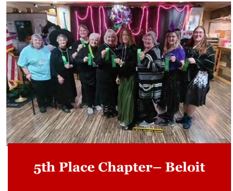
5th Place Chapter– Beloit