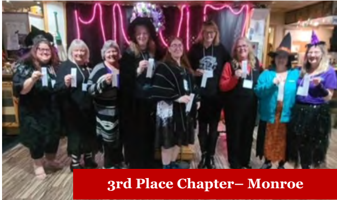
3rd Place Chapter– Monroe