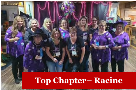
Top Chapter– Racine