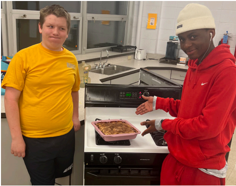
YUM! The middle and high school boys hone their baking skills.