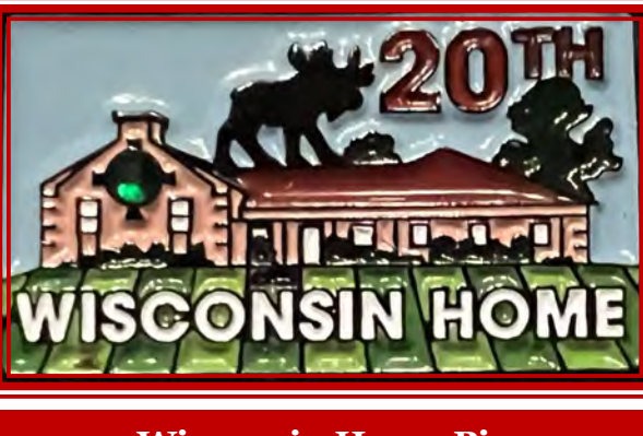
Wisconsin Home Pin